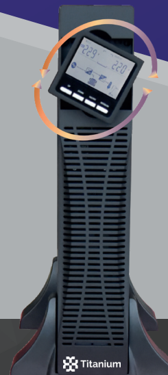
The LCD panel can be rotated