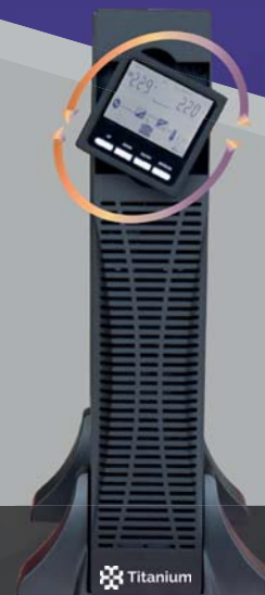
The LCD panel can be rotated